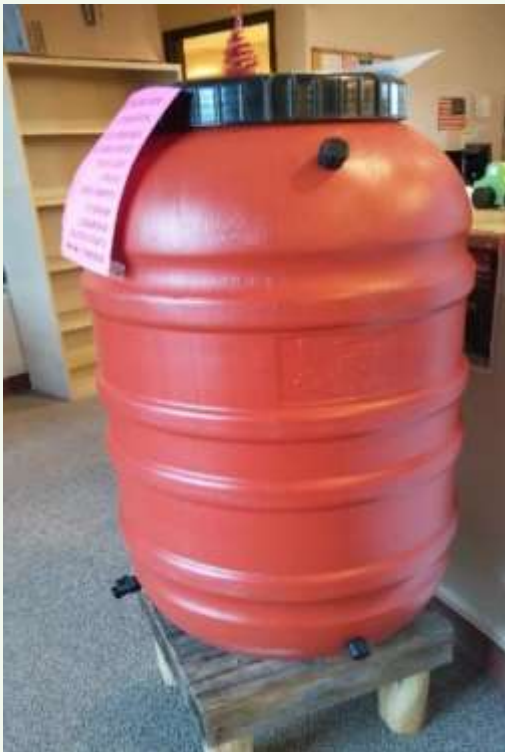
55 Gallon Rain Barrel

Please check out our Website @ http://www.epccd.org for more information